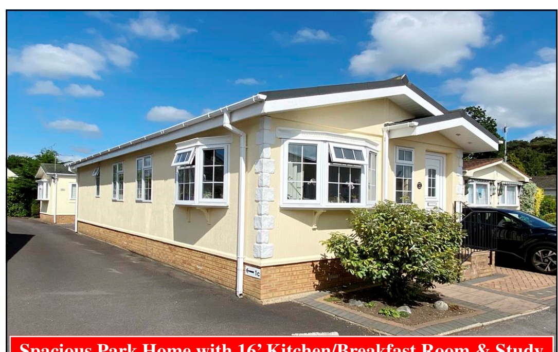
Spacious Park Home with 16' Kitchen/Breakfast Room & Study