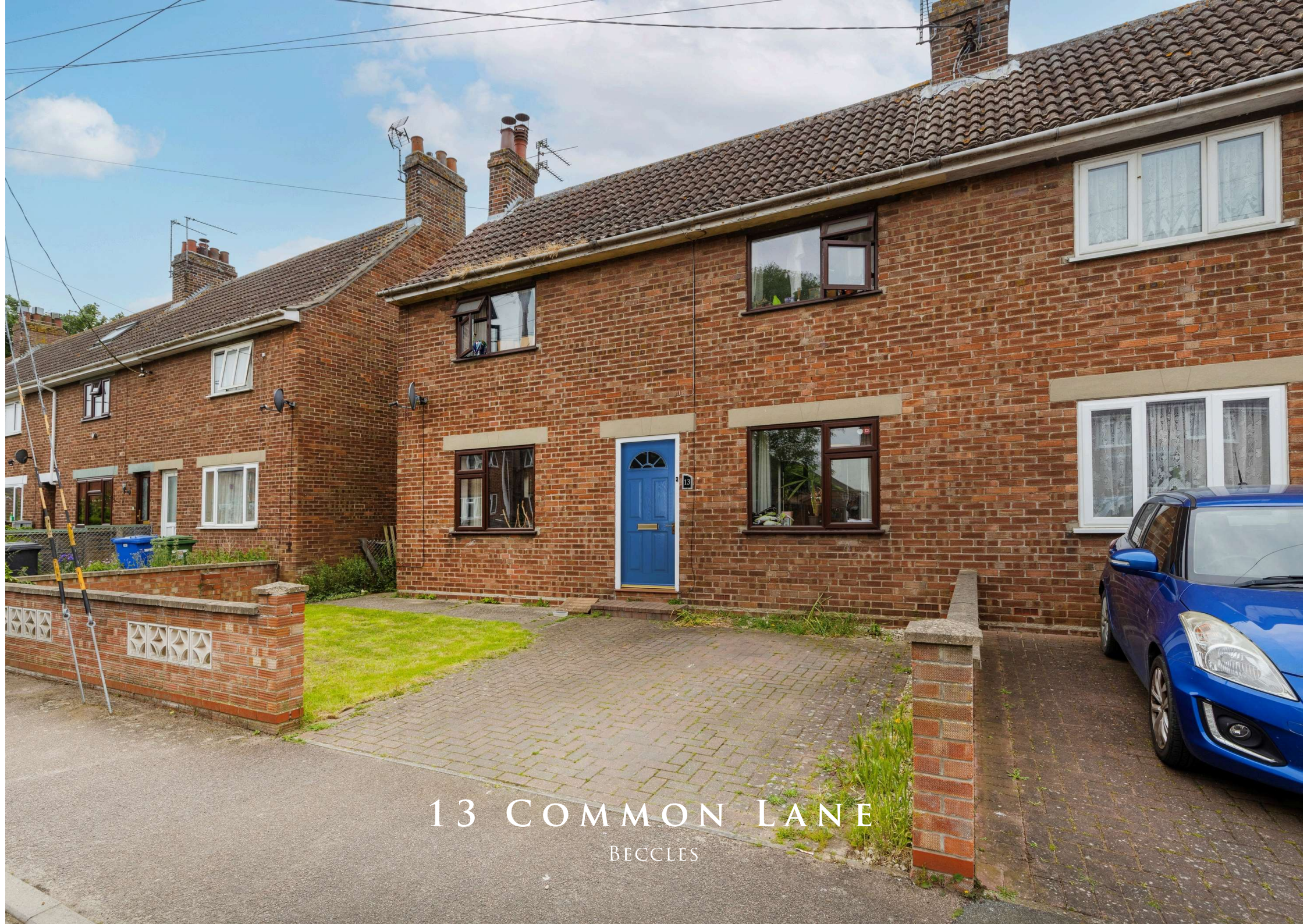
13 COMMON LANE BECCLES