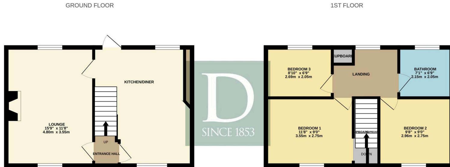
3 BEDROOM MID TERRACE

Whilst every attempt has been made to ensure the accuracy of the floorplan contained here, measurements of doors, windows, rooms and any other items are approximate and no responsibility is taken for any error, omission or mis-statement. This plan is for illustrative purposes only and should be used as such by any prospective purchaser. The services, systems and appliances shown have not been tested and no guarantee as to their operability or efficiency can be given. Made with Metropix ©2024