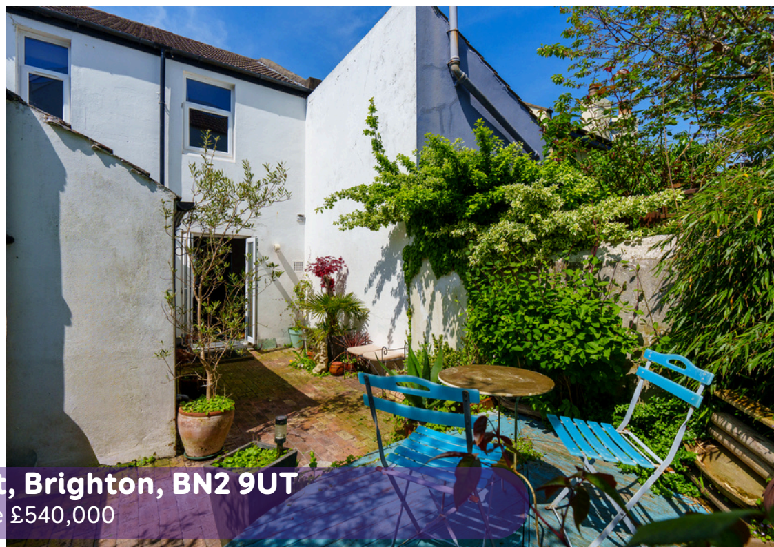
Southampton Street, Brighton, BN2 9UT Asking Price £540,000