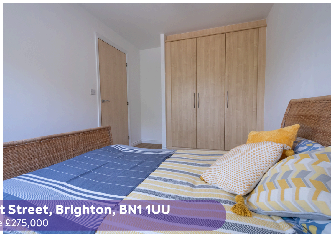
Boulevard House, Regent Street, Brighton, BN1 1UU Asking Price £275,000