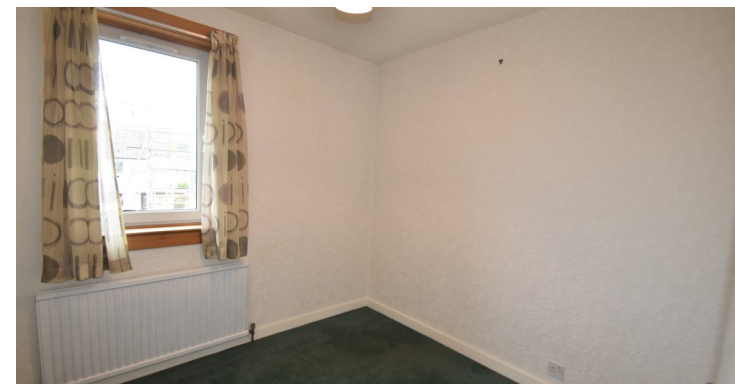
107 Main Street