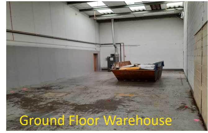
Ground Floor Warehouse

These particulars do not constitute, or form any part of, any offer or contract, and whilst all the information given is believed to be correct, all interested parties must satisfy themselves of its accuracy. All prices and rents are quoted exclusive of VAT, unless otherwise stated.