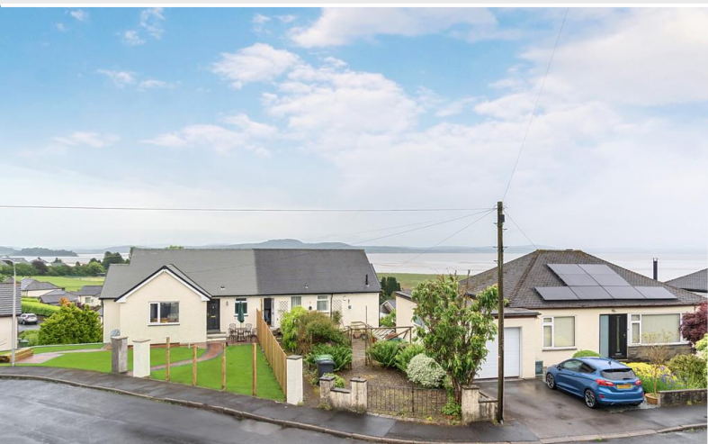
Views towards Morecambe Bay

Description Properties on The Old Nurseries do not come up very often so this one should not hang around too long. It won't disappoint either! No.15 occupies a prominent and elevated position making the most of the views in this sought after and peaceful residential cul-de-sac. The current vendor has loved and cared for it for a number of years and it is now time for them to pop the property on the open market. It really does have a little bit of everything. The rooms are spacious and light, many with dual aspects and lovely Bay views. It has a traditional lay out and has had some improvements over the years, such as an En-suite WC to Bedroom 1 and the addition of the Conservatory Porch. Now in need of a 'refresh' for the next owner to put their own stamp on.