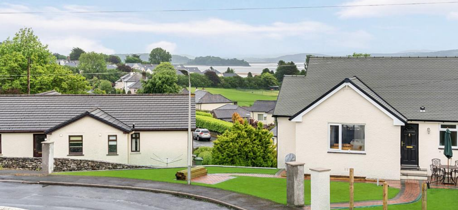
Views towards Morecambe Bay