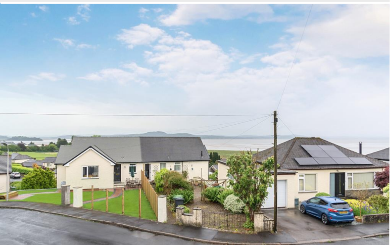
Views towards Morecambe Bay

Description Properties on The Old Nurseries do not come up very often so this one should not hang around too long. It won't disappoint either! No.15 occupies a prominent and elevated position making the most of the views in this sought after and peaceful residential cul-de-sac. The current vendor has loved and cared for it for a number of years and it is now time for them to pop the property on the open market. It really does have a little bit of everything. The rooms are spacious and light, many with dual aspects and lovely Bay views. It has a traditional lay out and has had some improvements over the years, such as an En-suite WC to Bedroom 1 and the addition of the Conservatory Porch. Now in need of a 'refresh' for the next owner to put their own stamp on.