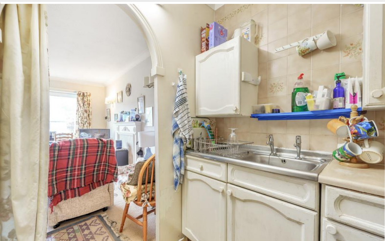
Kitchen to Living/Dining Room

Description 24 Strand Court is a low maintenance purpose built Retirement Apartment in this sought after development. It enjoys pleasing views over the town to the rear and is extremely convenient to the amenities of Grange.