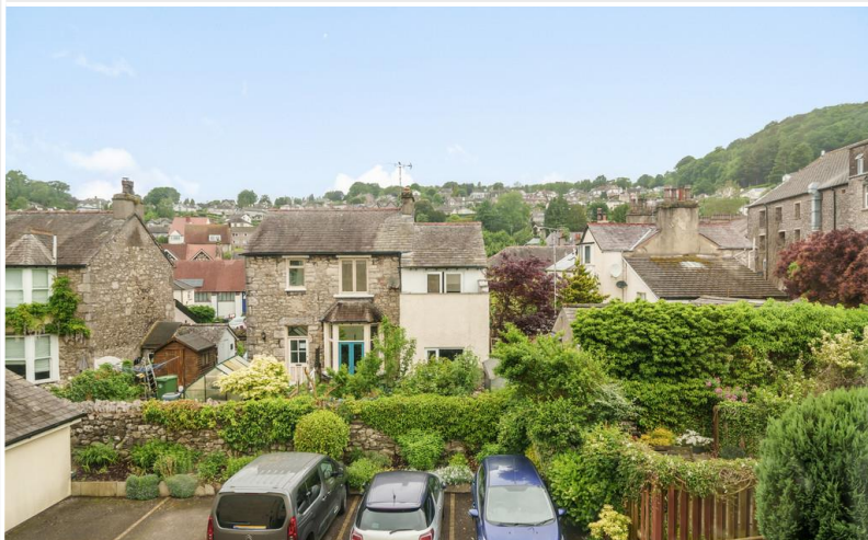
View to the rear