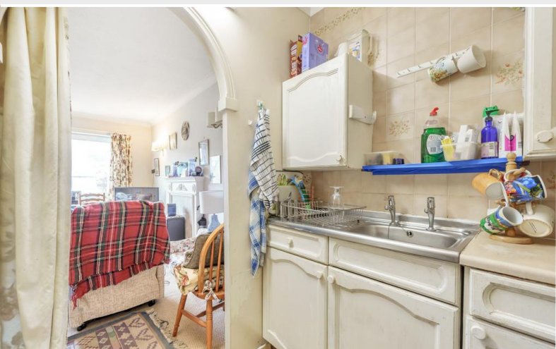
Kitchen to Living/Dining Room

Description 24 Strand Court is a low maintenance purpose built Retirement Apartment in this sought after development. It enjoys pleasing views over the town to the rear and is extremely convenient to the amenities of Grange.