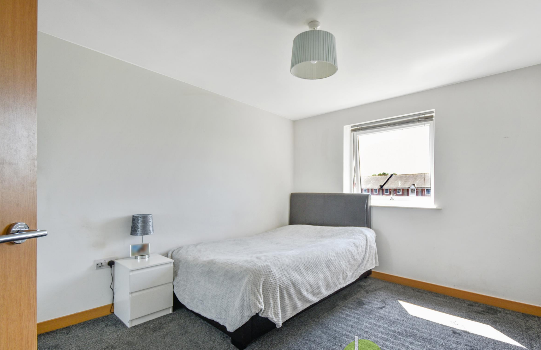
Heia Wharf Hawkins Road, Colchester, CO2