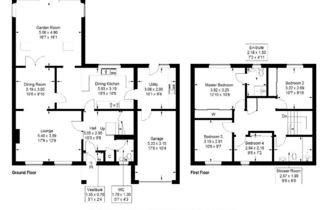
Illustration for identification purposes only, measurements are approximate, not to scale. FloorplansUsketch.com @ 2024 (ID1087020)

Approximate Gross Internal Area (Including Garage) 186.5 sq m / 2007 sq ft