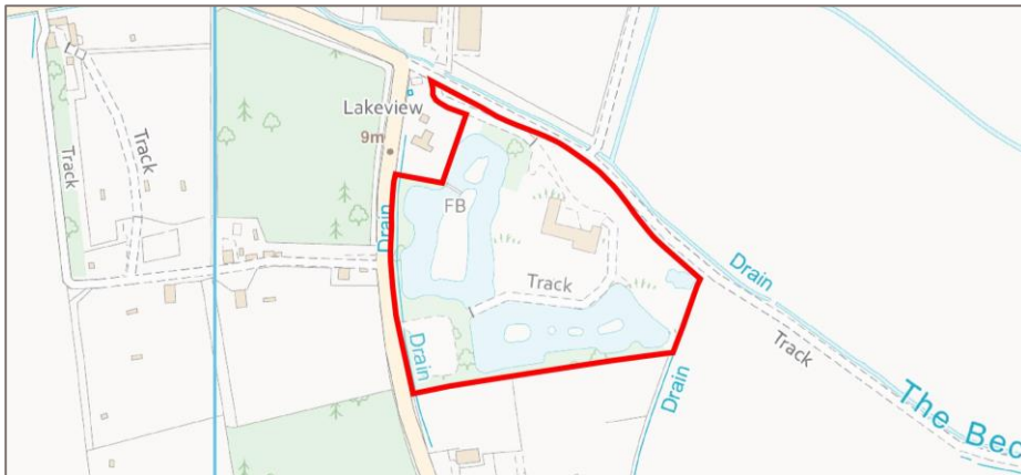
Indicative plan for information only