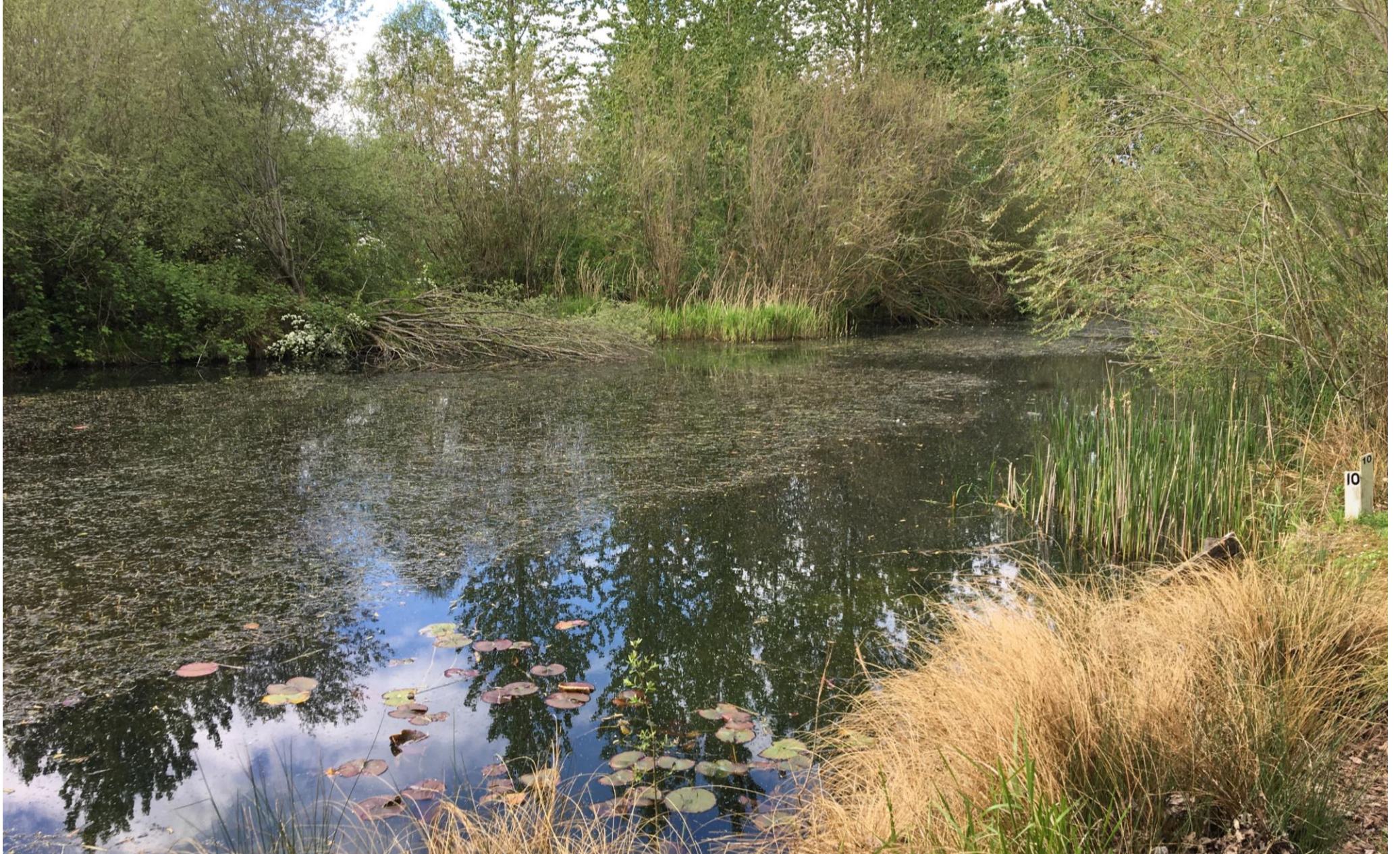
Avison Young | Priory Lakes, Lakeview, Priory Road, Ruskington, Sleaford, Lincolnshire, NG34 9DJ