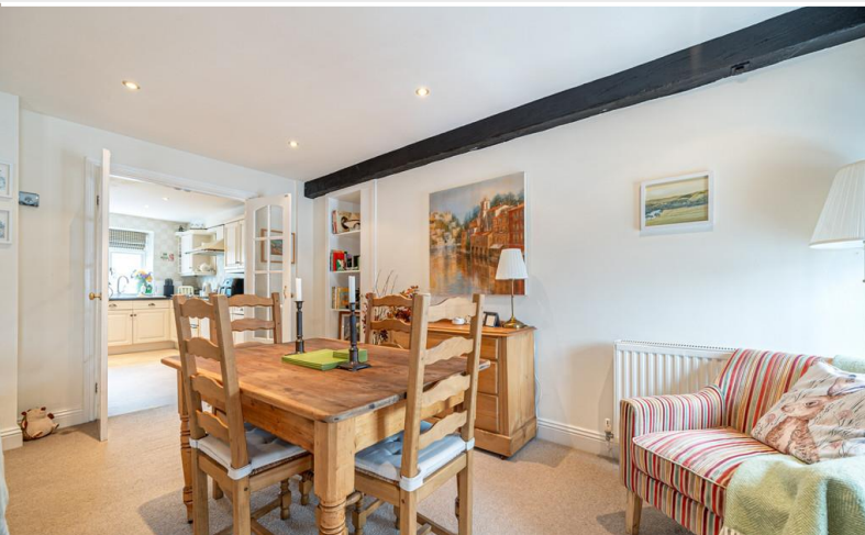
Open Plan Living/Dining Room