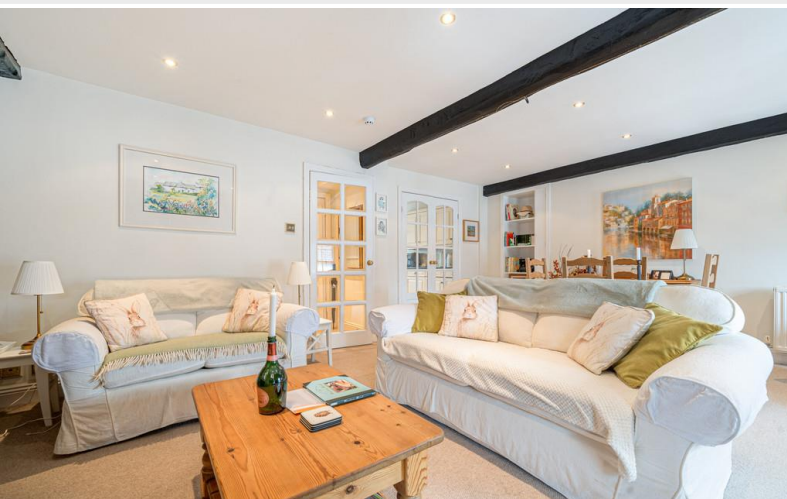
Open Plan Living/Dining Room