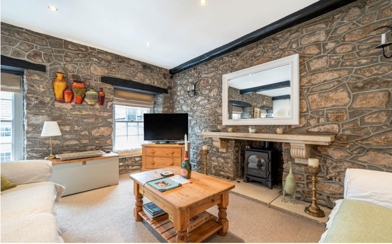
Open Plan Living/Dining Room