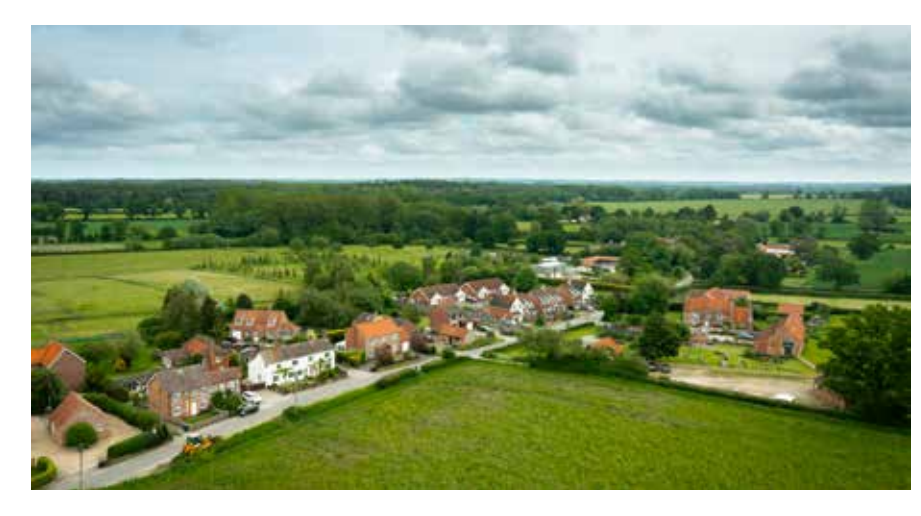
Aerial view of The Old Chequers and surrounding area

Life moves at a leisurely pace in Holt, and there are plenty of places to idle over a coffee or bite to eat. Believed to be the oldest house in town, Byfords deli and café is a central landmark and fabulous place to stop and watch the world go by. There's no need to hurry home – relax and enjoy country life! On the edge of town is the eponymous Gresham's school. And, should you need to spread your wings a little wider, head to the heathland of Holt Country Park or Spout Hills and reconnect with nature.