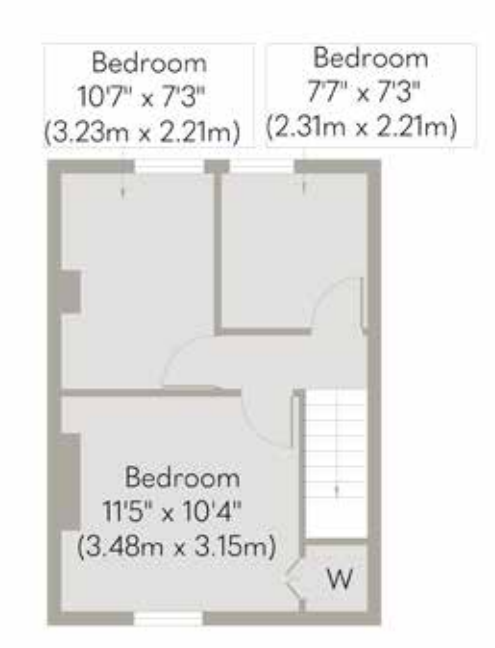
First Floor Approximate Floor Area 318 sq. ft (29.57 sq. m)