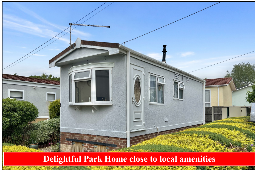
Delightful Park Home close to local amenities

52 Iford Bridge Park, Old Bridge Road, Iford, Bournemouth. BH6 5RQ