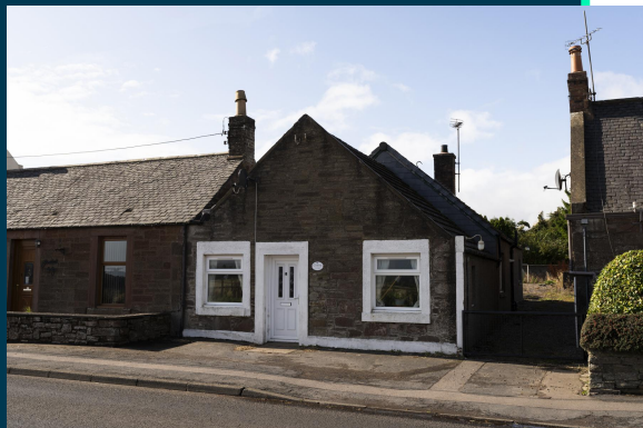
Cherry Cottage, Colliston, Arbroath, DD11 3RP