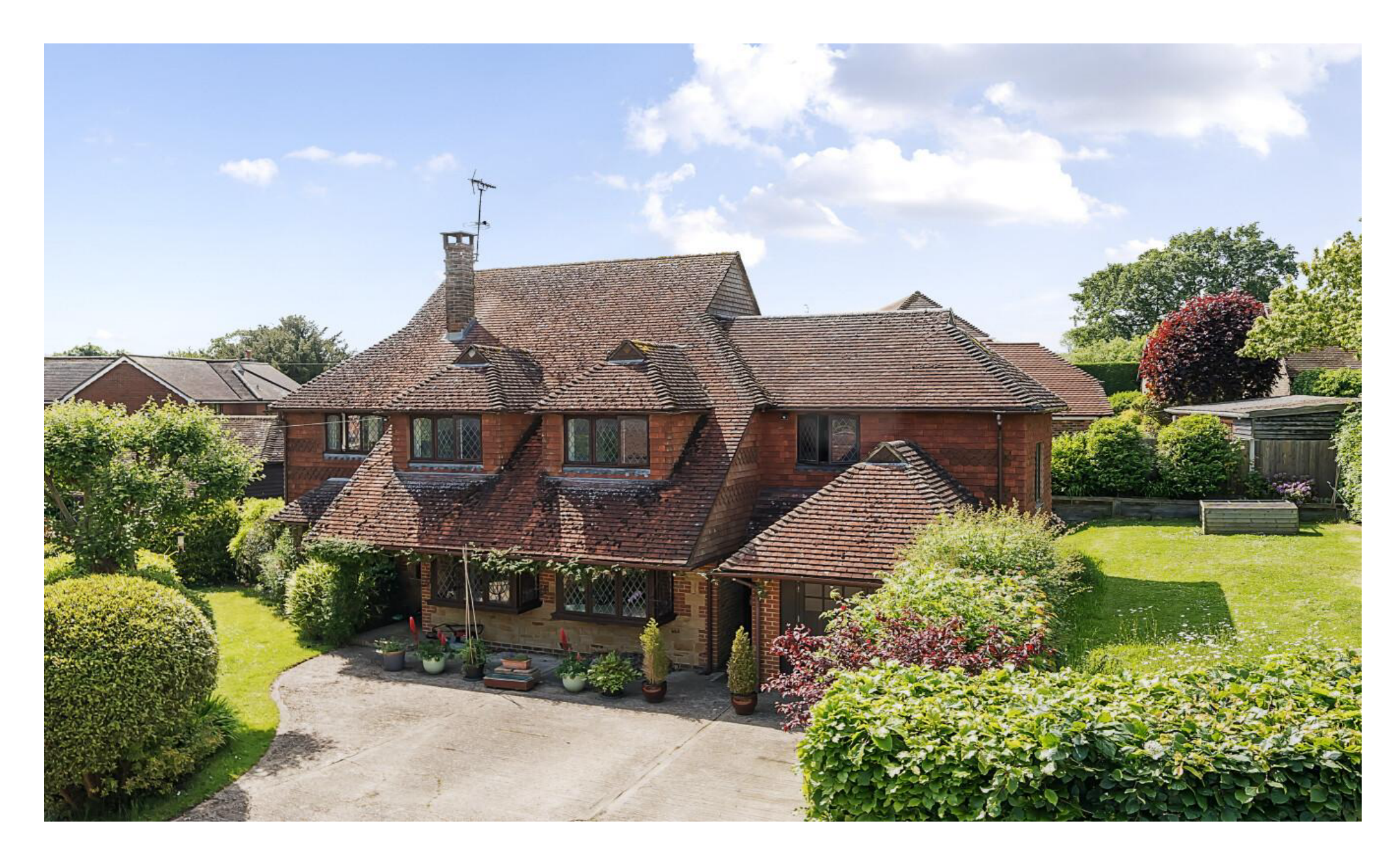
£775,000 East Street, West Chiltington, West Sussex