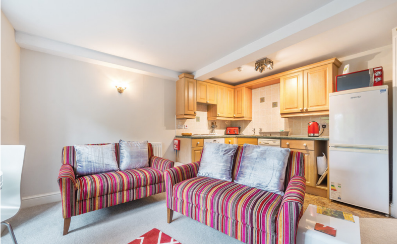
Open Plan Living Room and Kitchen