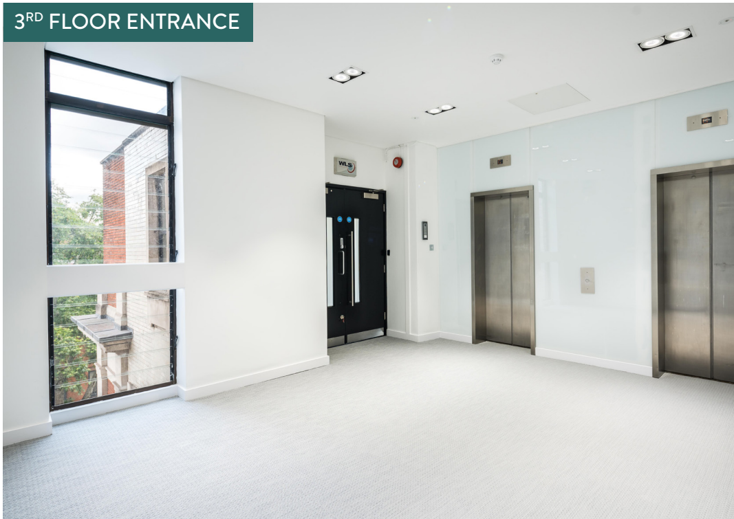
3 RD FLOOR ENTRANCE