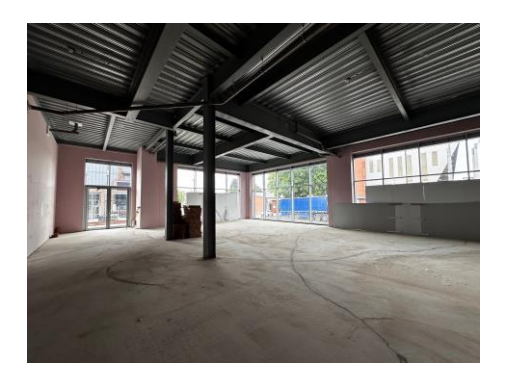
Siddall Jones | The Mint | 95 Icknield Street | Birmingham | B18 6RU