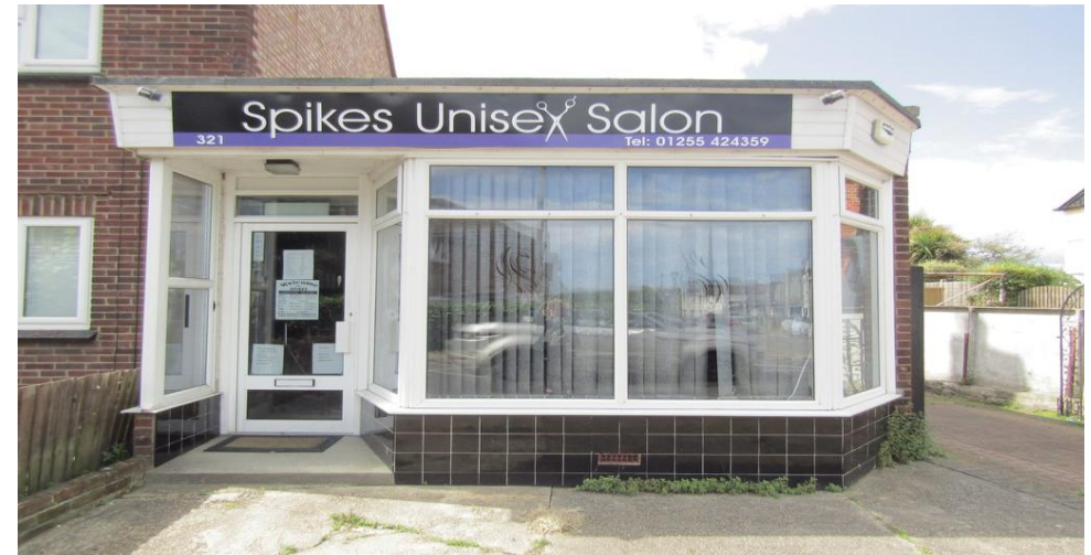
Old Road Clacton-on-Sea

Rent: £600 pcm Energy Efficiency Rating TBC