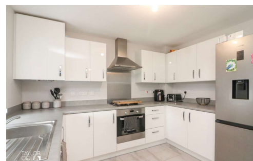
Longbourn Crescent Tamworth, Staffordshire, B78 3ES