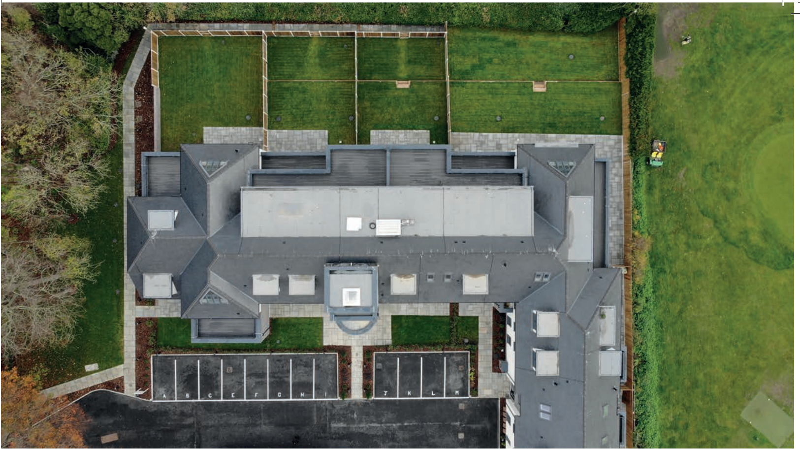
The Fairways | Convent Road | Broadstairs | CT10 3PX