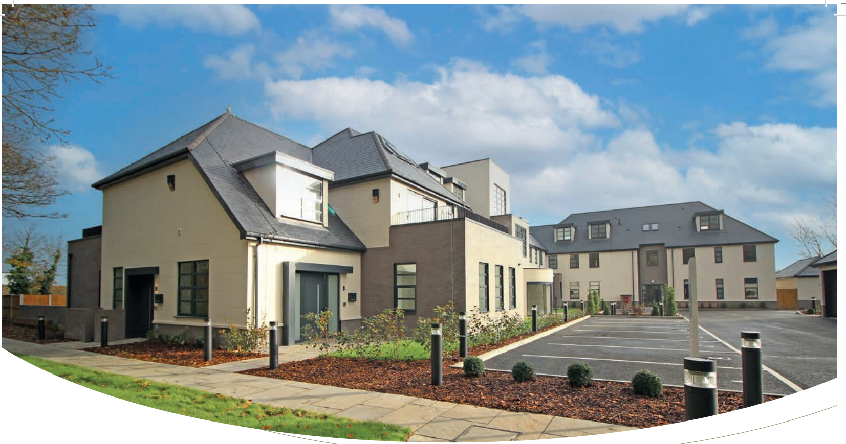
The Fairways | Convent Road | Broadstairs