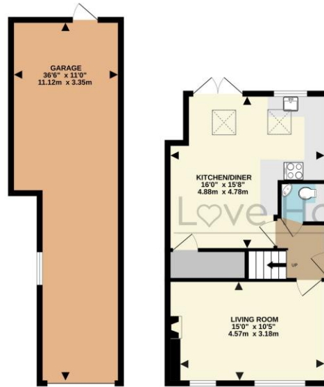
GROUND FLOOR 796 sq. ft. (73.9 sq.m.) approx.