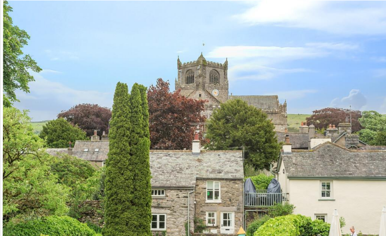
Views towards Cartmel Priory