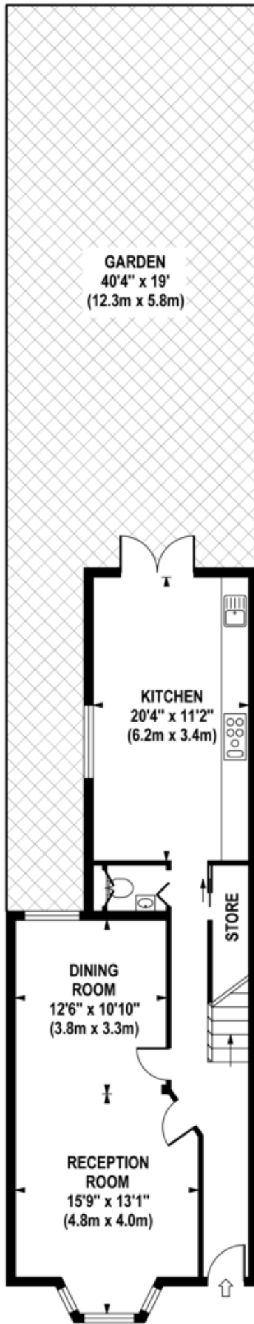
GROUND FLOOR GROSS INTERNAL