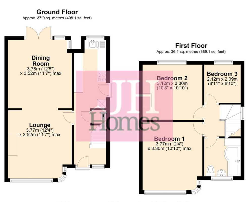
Total area: approx. 74.1 sq. metres (797.2 sq. feet)