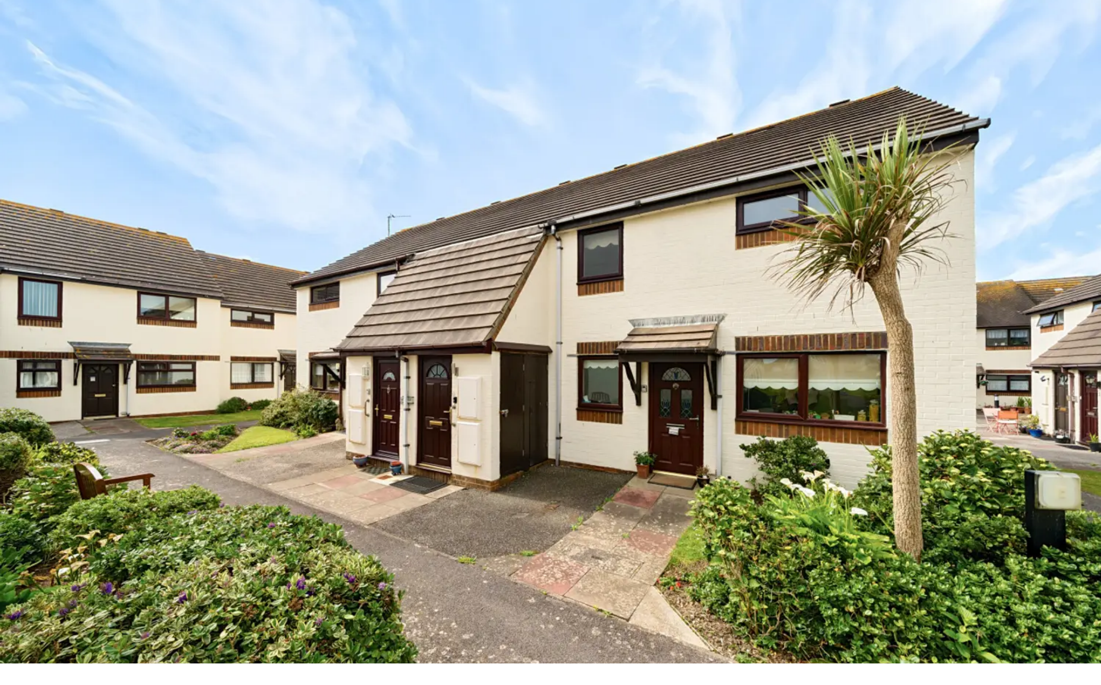
Flat 12, Seaview Court Hillfield Road, Selsey Guide Price £155,000 Leasehold