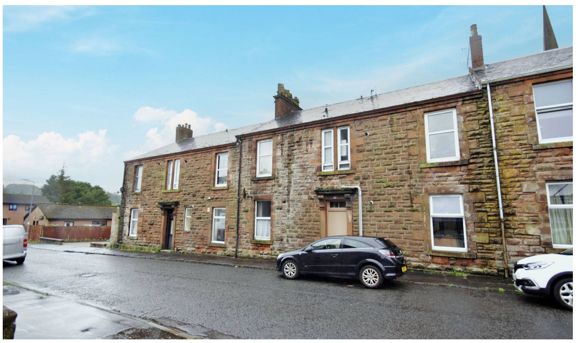
10 Ranoldcoup Road, Darvel KA17 0JU