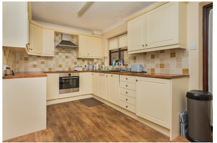
Nursery Gardens Irthlingborough NN9 5DE Freehold Price £280,000

Wellingborough Office 27 Sheep Street Wellingborough Northants NN8 1BS 01933 224400