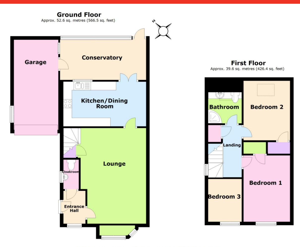
Total area: approx. 92.2 sq. metres (992.9 sq. feet)