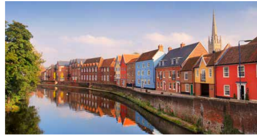
Overlooking the river Wensum and Norwich Cathedral.

“A beautiful city to be located so close to.”