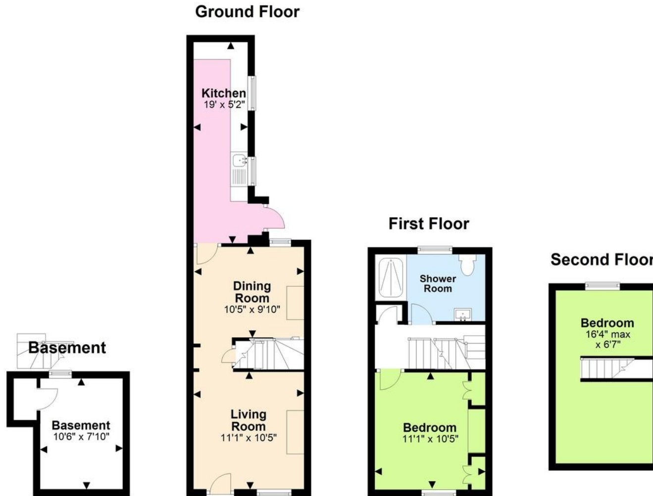
For illustrative purposes only. Not to scale. Plan produced using PlanUp.