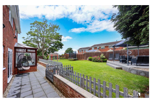
Cleasby Wilnecote, Tamworth, Staffordshire, B77 4JL