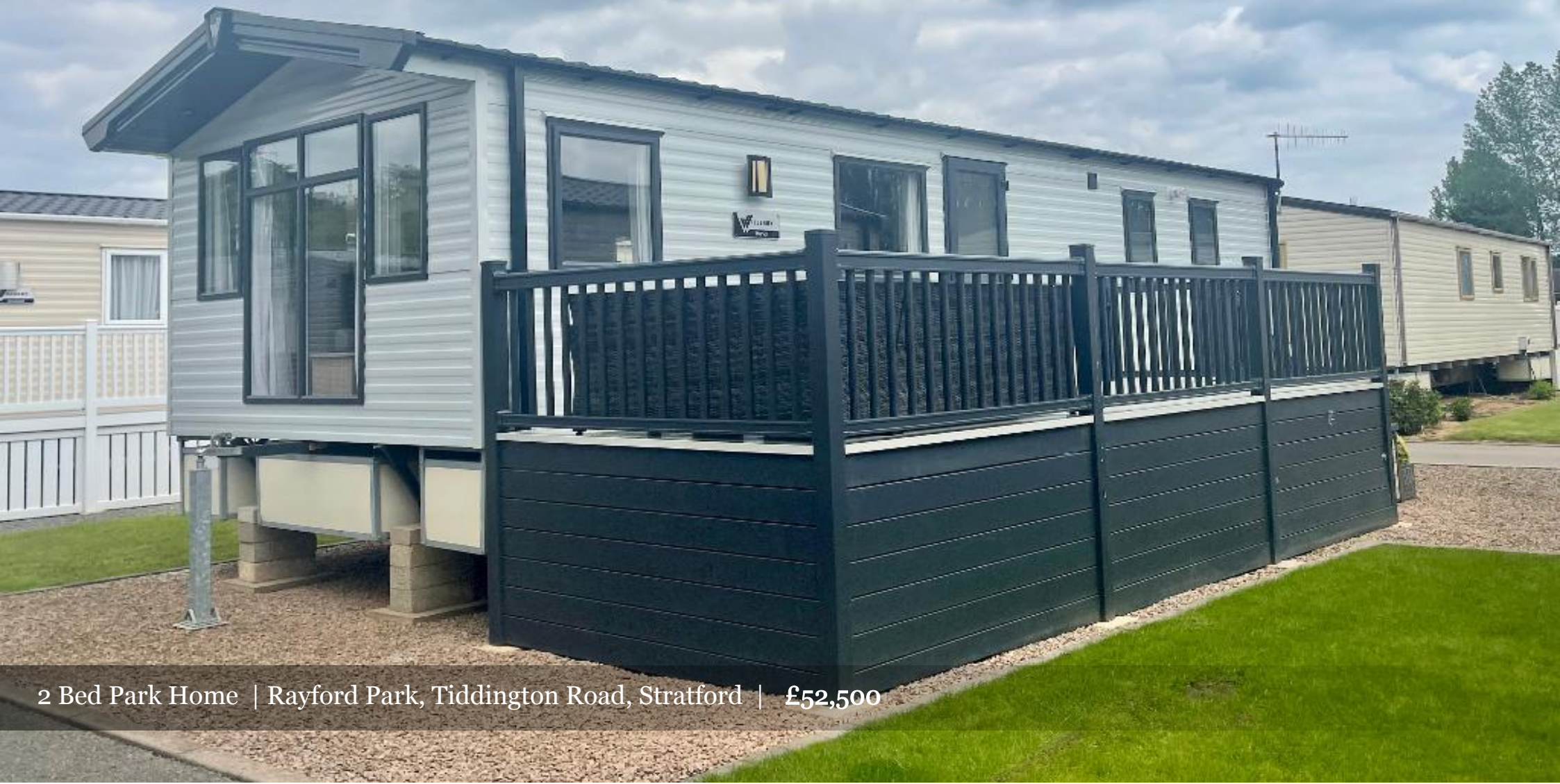
2 Bed Park Home | Rayford Park, Tiddington Road, Stratford | £52,500