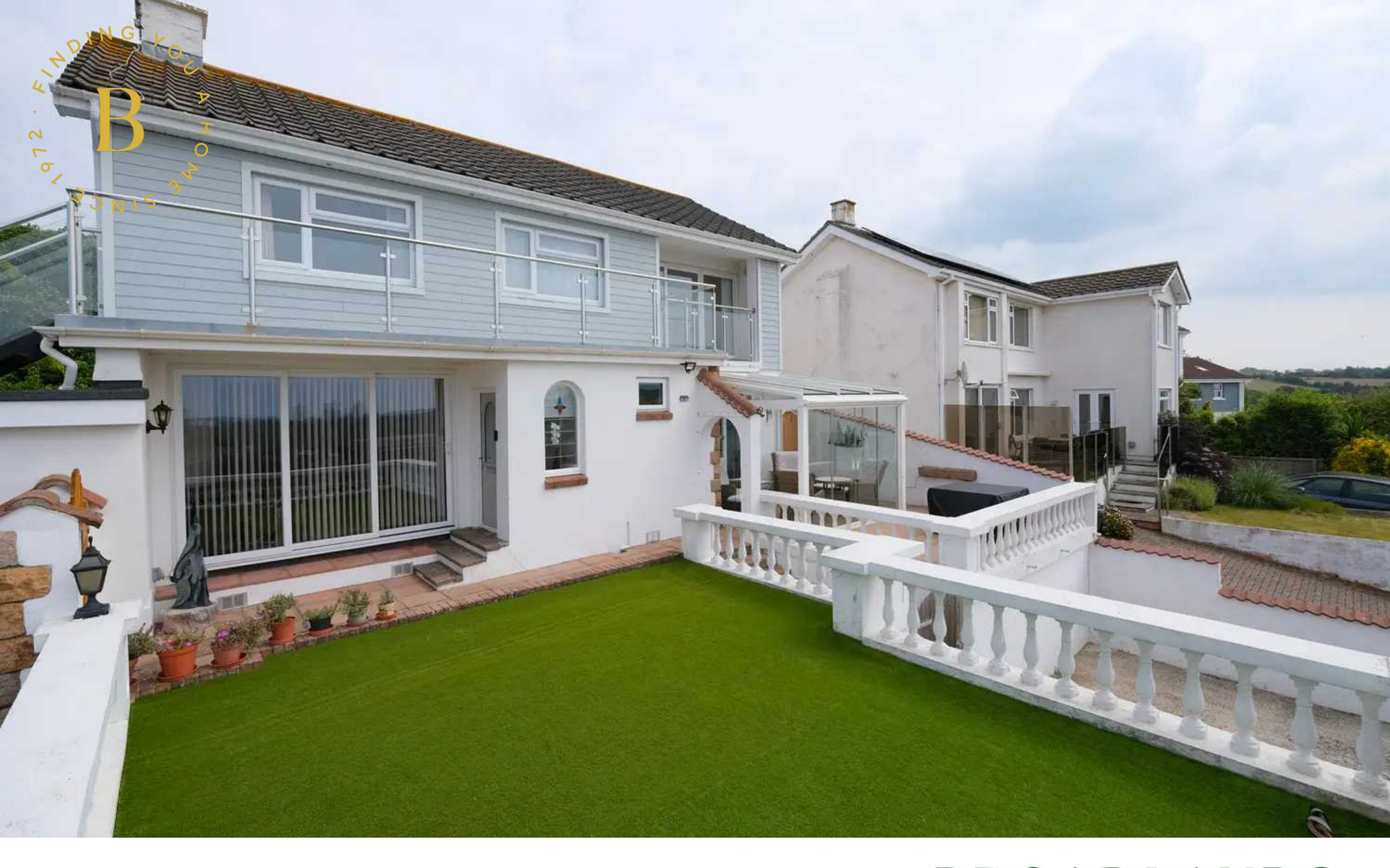
L'Ancrage, Old Brickfield Lane, St. Saviour Guide Price £1,050,000