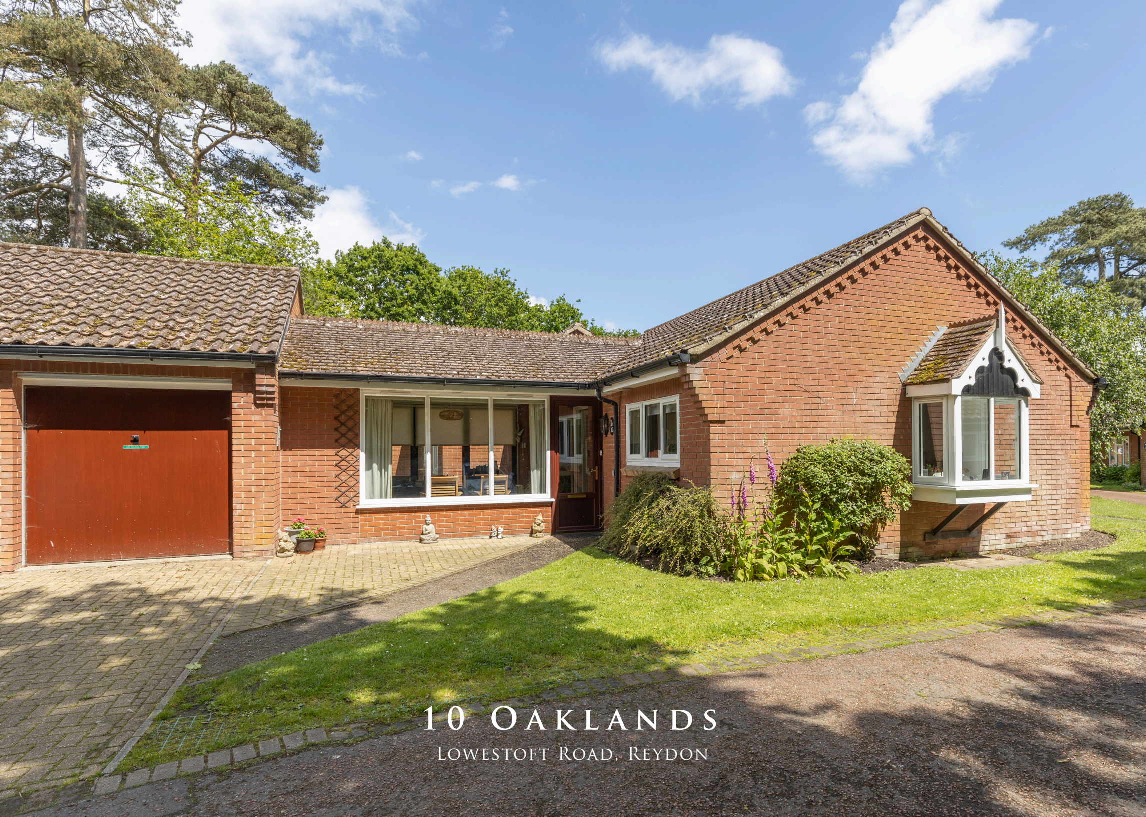
10 OAKLANDS LOWESTOFT ROAD, REYDON