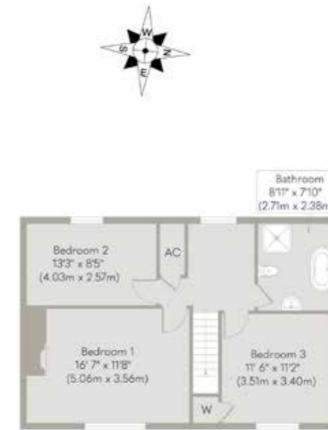
First Floor Approximate Floor Area 641 sq. ft. (59.51 sq. m)