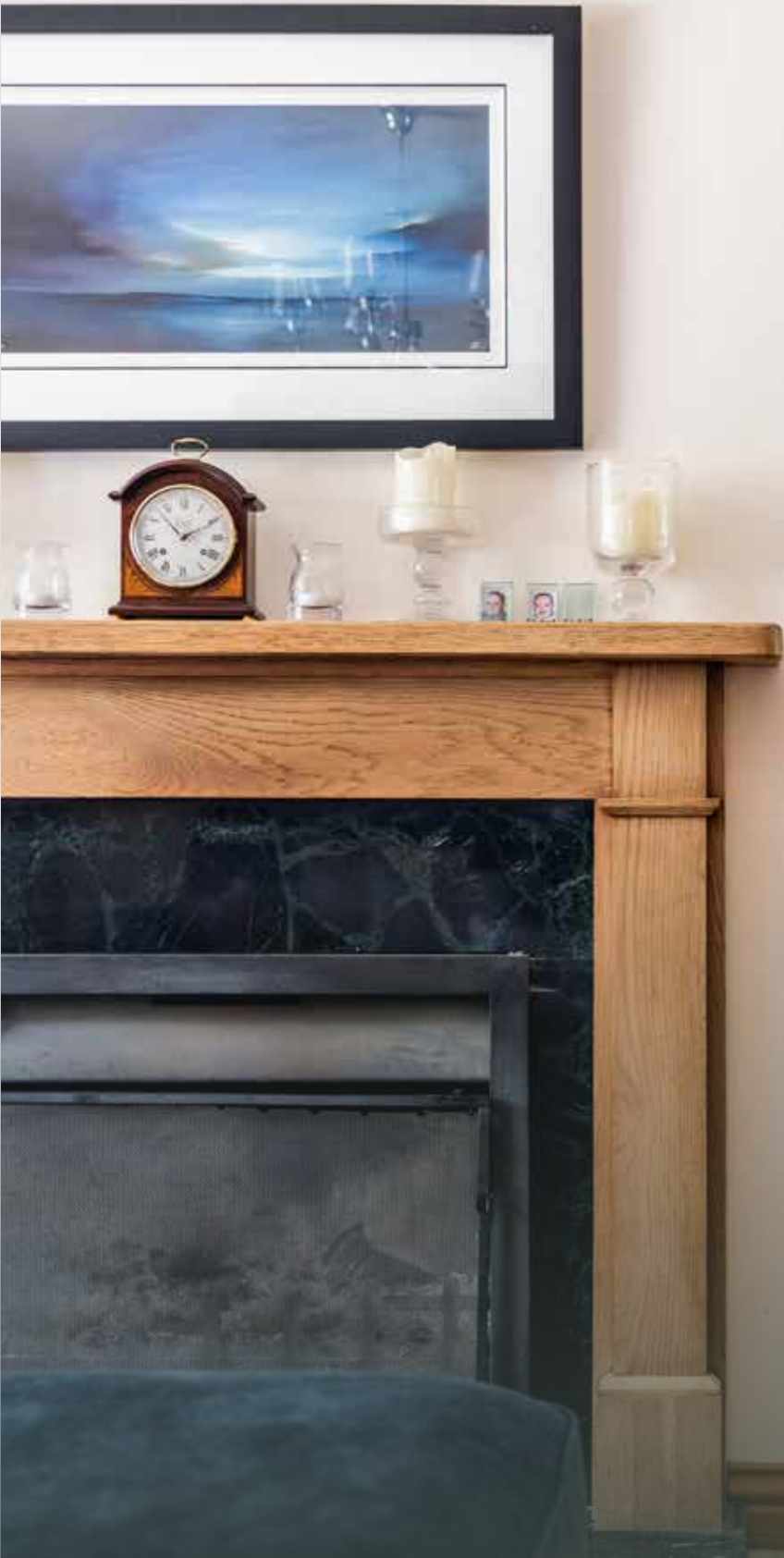
“The sitting room, with its inviting open fire, becomes a cosy haven, especially during the winter months.”