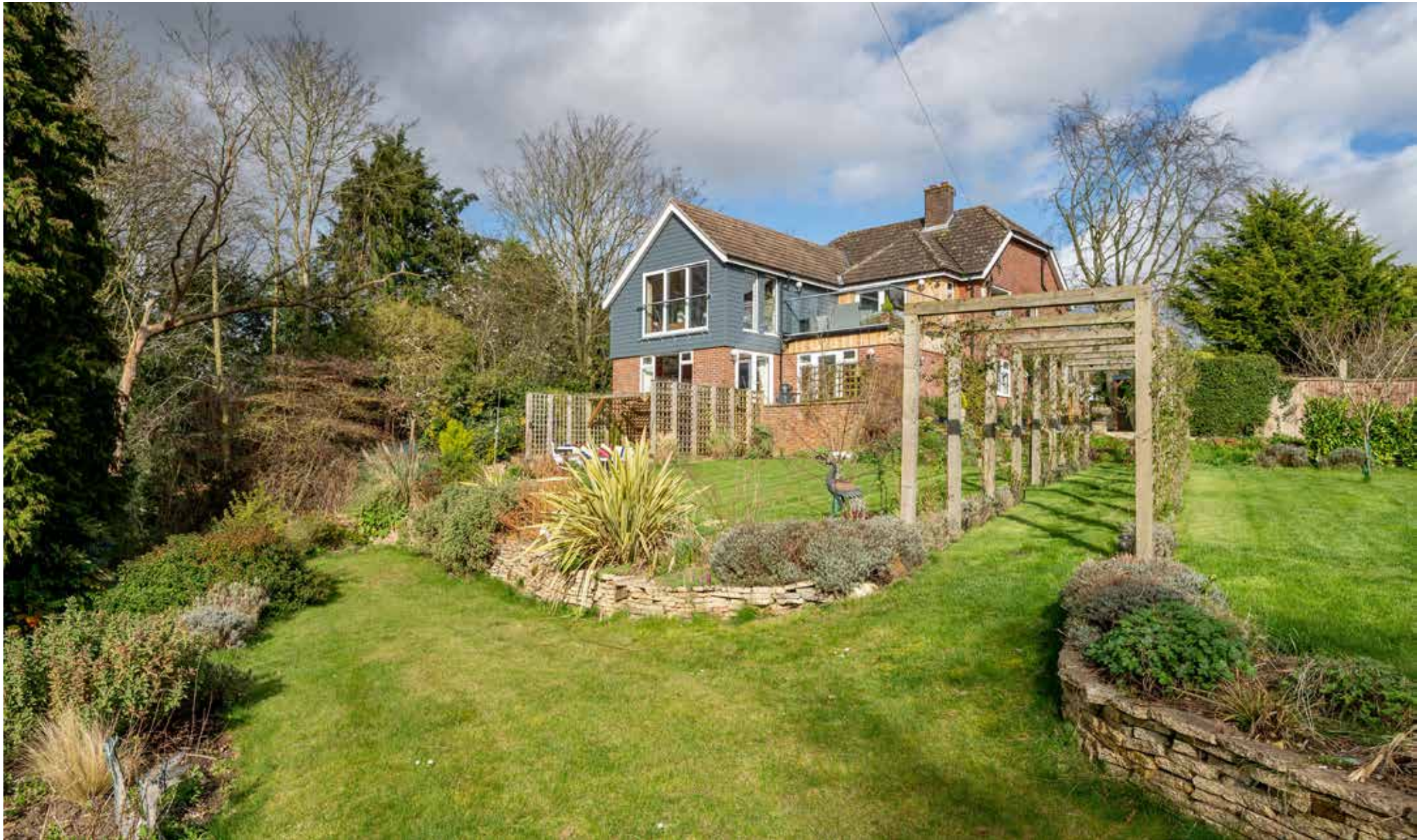
Garden House Dereham | Norfolk | NR19 2DZ