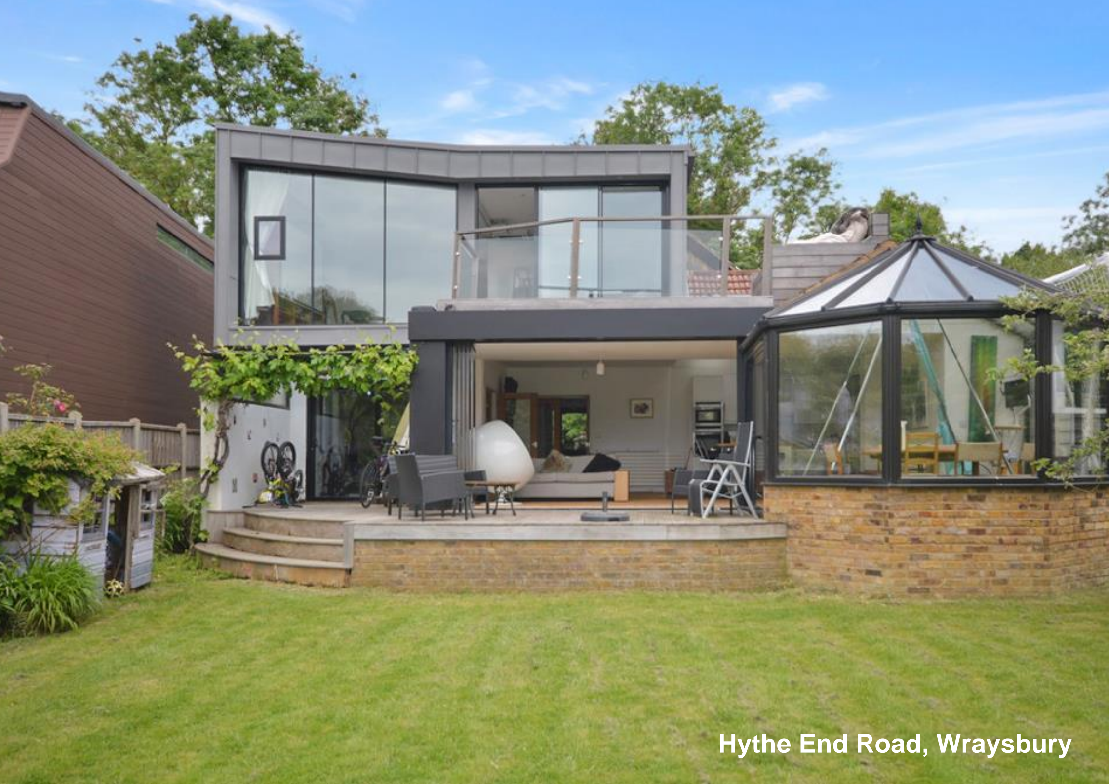
Hythe End Road, Wraysbury