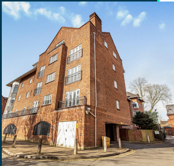
Central Place, Station Road Wilmslow, SK9