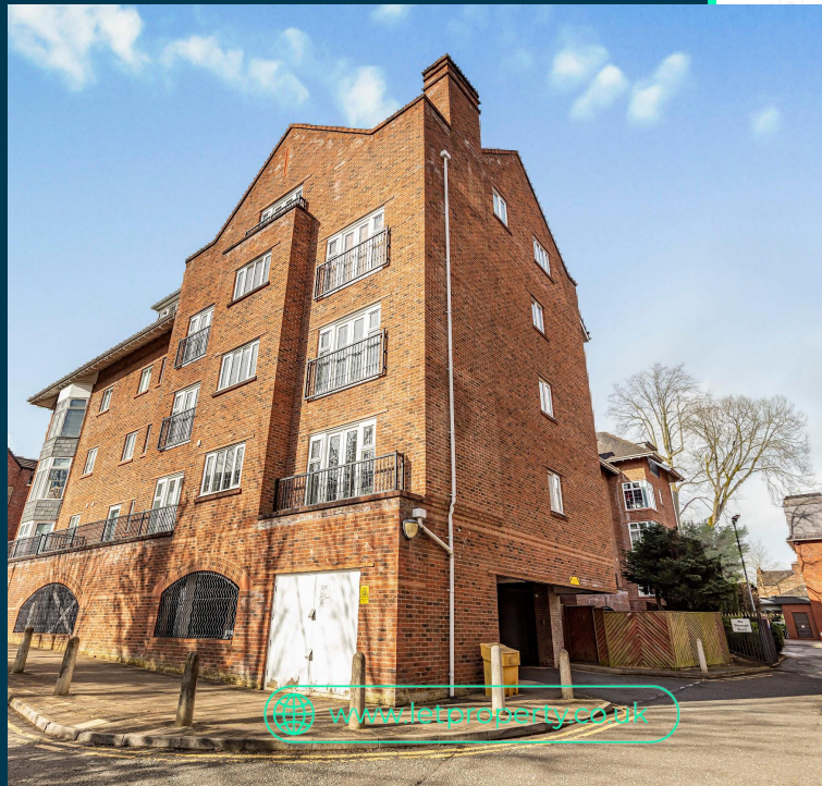
Central Place, Station Road Wilmslow, SK9