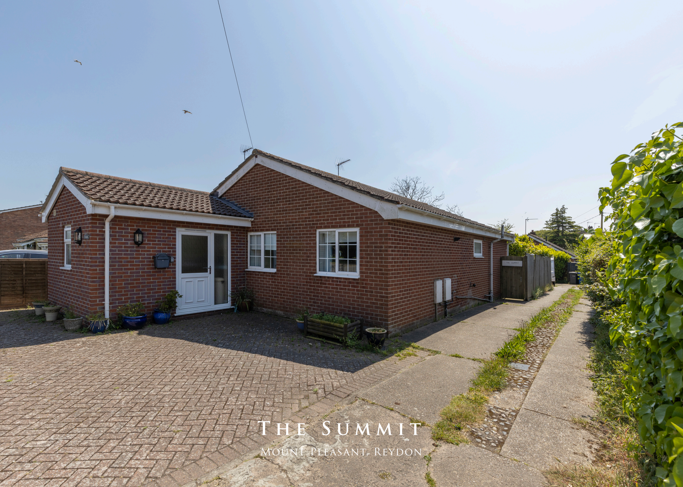
THE SUMMIT MOUNT PLEASANT, REYDON