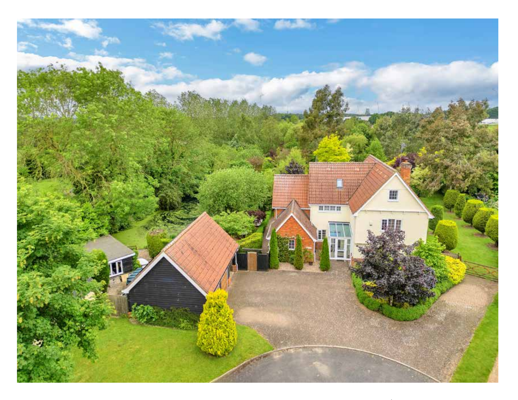
The Grange 1 Langton Park | Eye | Suffolk | IP23 7LZ