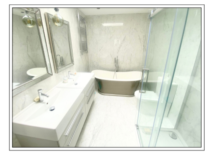
Orchard Drive, Park Street, St Albans AL2 2HQ