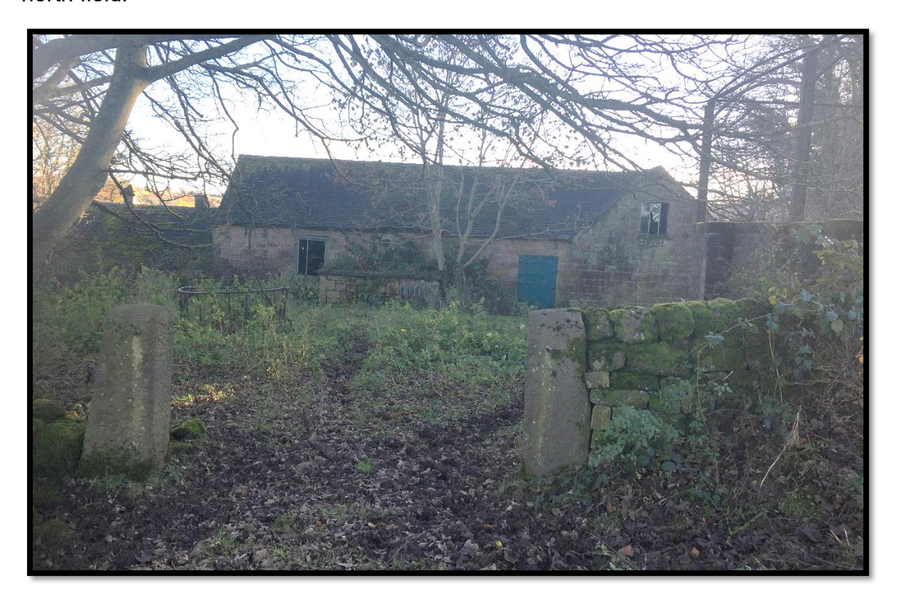
Part of northern stone boundary wall in need of repair.

Northern Elevation of northern barns, including enclosed yard as viewed from adjacent north field.