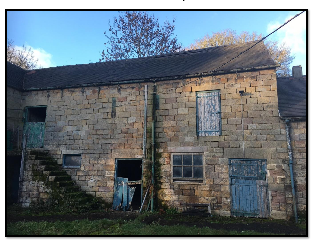
The eastern end of the northern barns, drop down to single storey.

The northern barns are very substantial and generally in good condition. The central section of the northern barns, which has two storeys, can be seen below.