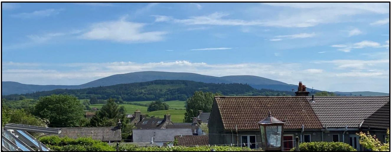
View from garden