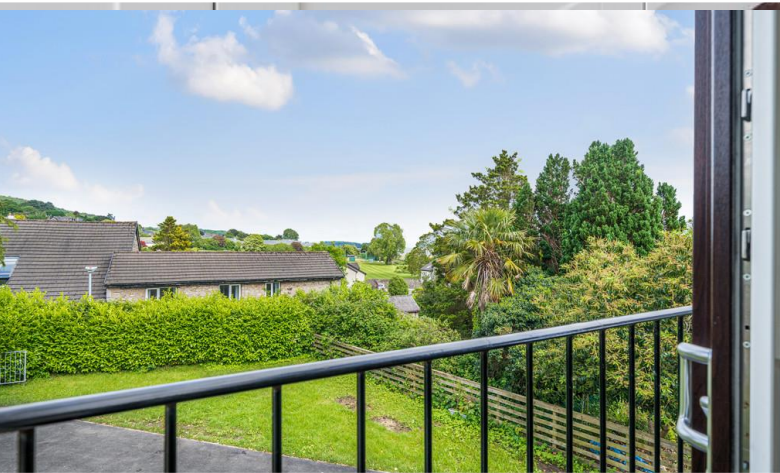
View from Open Plan Living/Dining/Kitchen