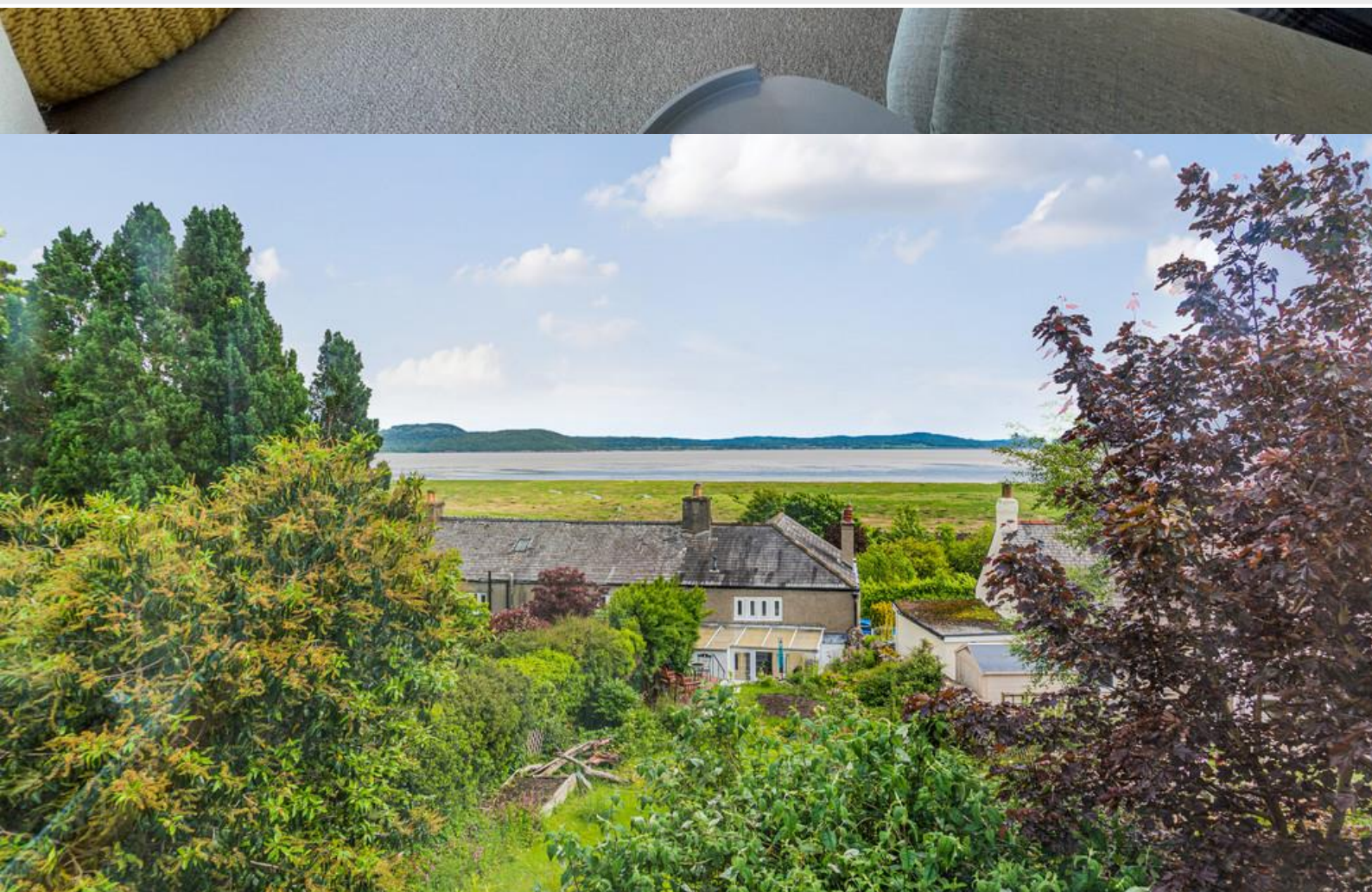
Views from rooftops towards Morecambe Bay