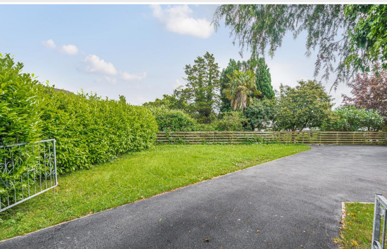
Driveway and Parking

Viewings: Strictly by appointment with Hackney & Leigh Grange Office.