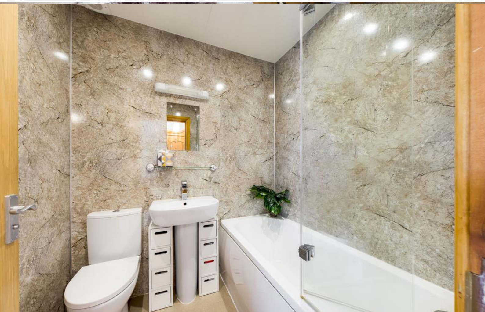
En-Suite Bathroom to Bedroom 1