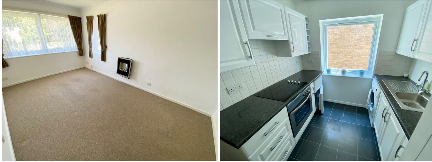
Flat 5, 27 Brambledown Road, South Wallington, Surrey, SM6 0TH | £229,950 Leasehold

This well presented first floor apartment is situated in a popular road on the south side of Wallington benefits from a long lease and no chain. The property boasts a good size double aspect lounge and a fitted kitchen. The 13'8 bedroom has built in wardrobes and there is a modern bathroom. Outside there are well maintained communal gardens.