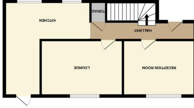
GROUND FLOOR 502 sq.ft. (46.6 sq.m.) approx.

If you require the full EPC certificate direct to your email address please contact the sales branch marketing this property and they will email the EPC certificate to you in a PDF format. Please note that on occasion the EPC may not be available due to reasons beyond our control, the Regulations state that the EPC must be presented within 21 days of initial marketing of the property. Therefore we recommend that you regularly monitor our website or email us for updates. Please feel free to relay this to your Solicitor or License Conveyor.